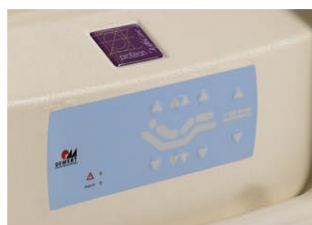
Foil Control Panel