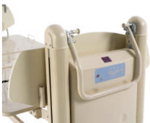
3 Position Adjustable Push Handle

The new Protean 4 comes standard with Kneebreak, Trendelenburg (and reverse), 3 Position Adjustable Push Handle for easy manoeuvring, CPR release (release handles both sides of backrest), 1.2Ah Battery Backup, Standard Castors and 10 button handset.