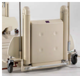
Wall Bumper Bar