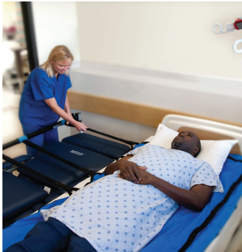
PTS transfers patients with ease.