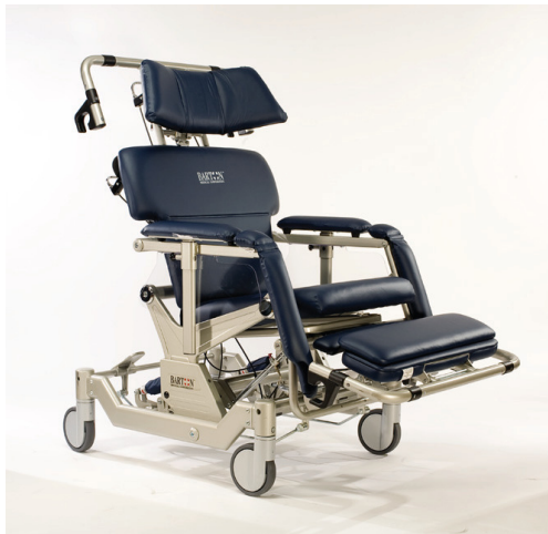
Adjustable head & foot rests